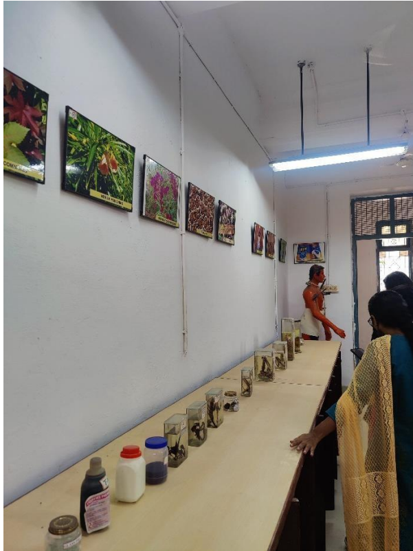
C) Forensic Toxicology