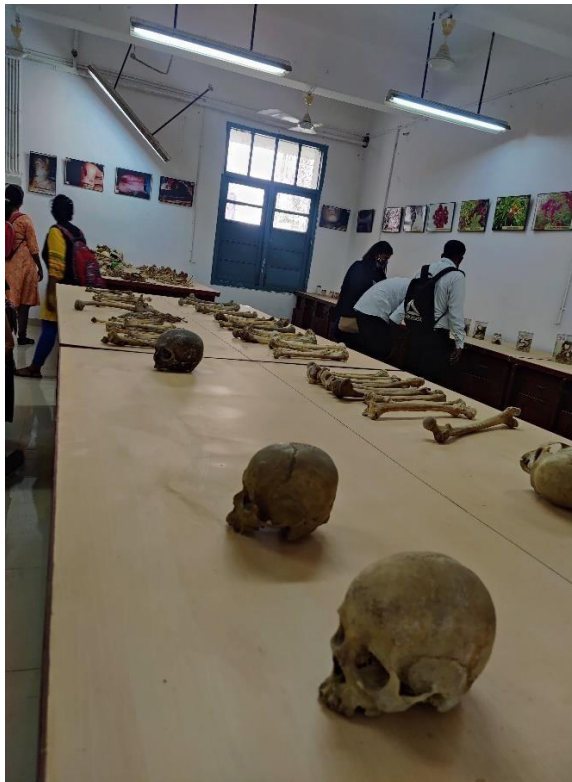
D) Skulls and Bones