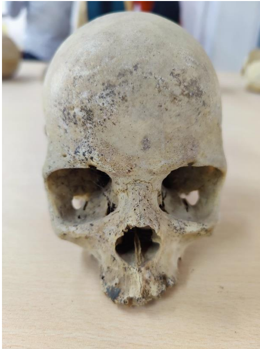
A) Picture of a Human Skull