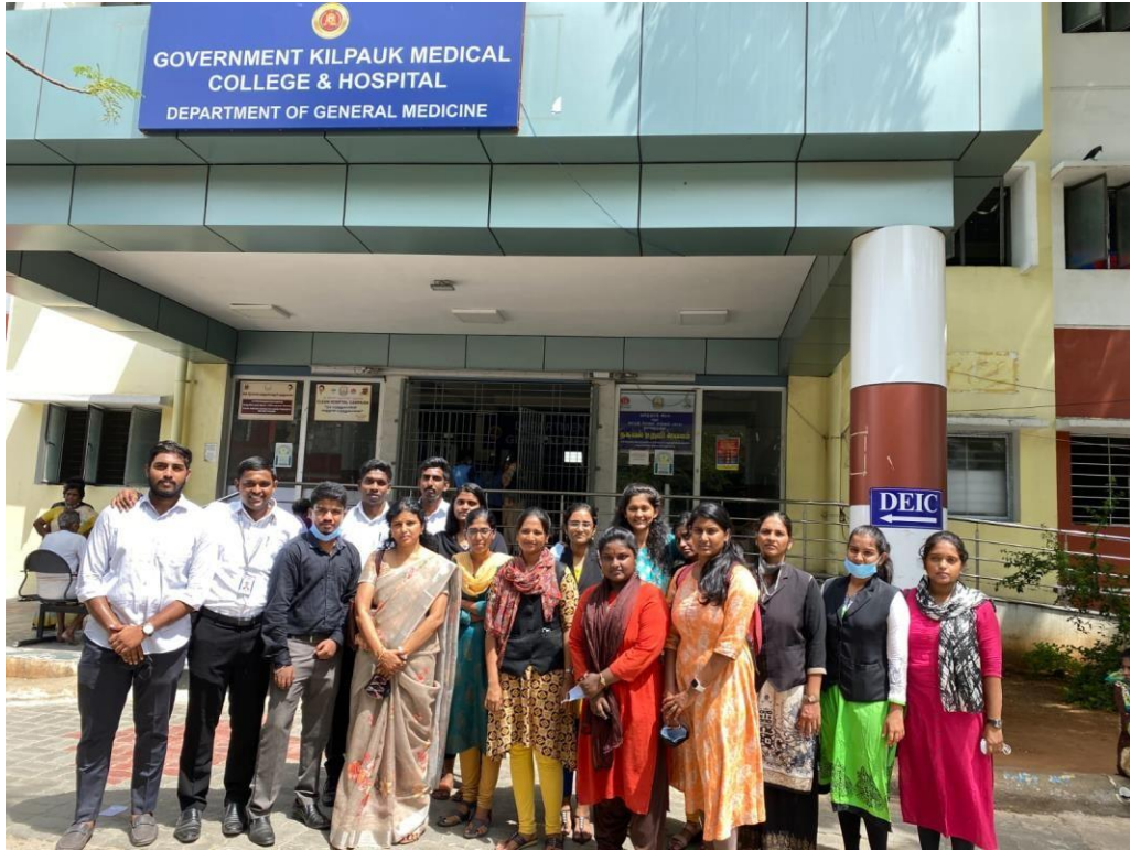
G) Class Group Picture