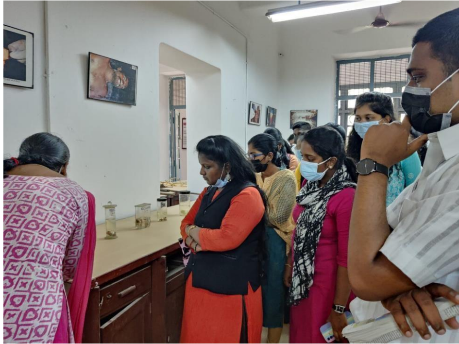
E) Images taken during Interaction