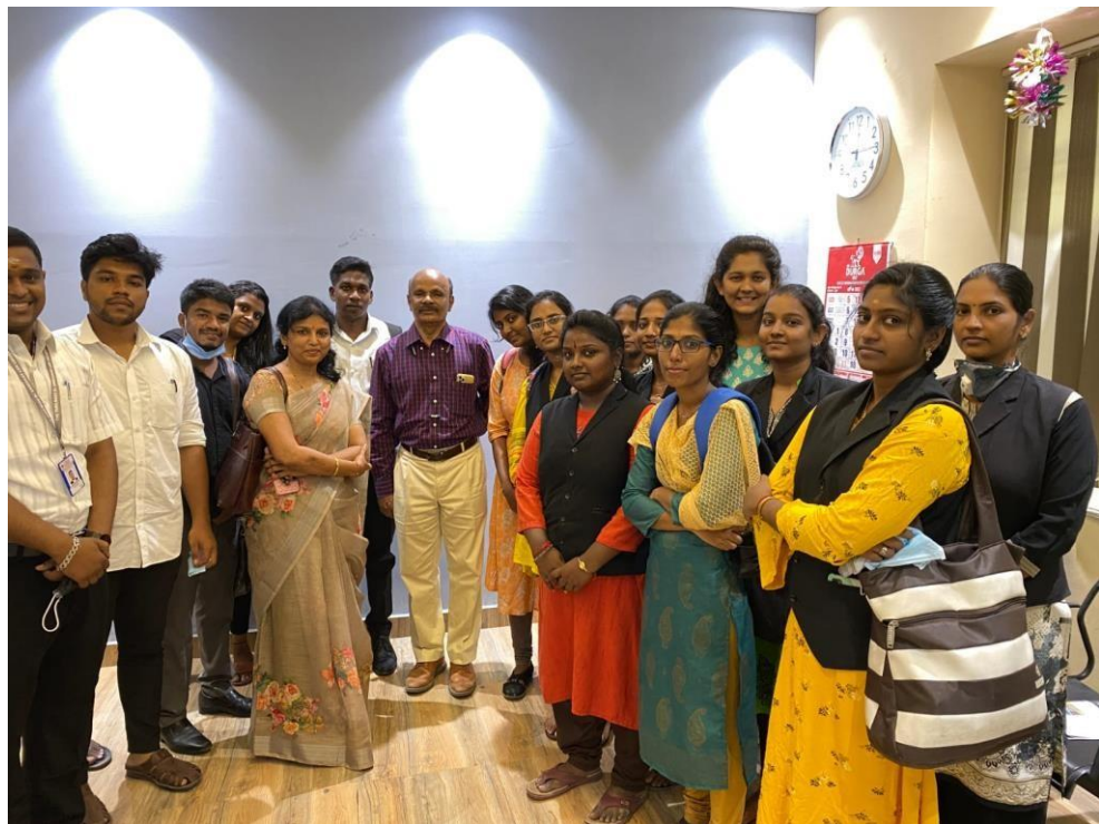
F) Group Picture with the Head of Department of the Department of Forensic Medicine